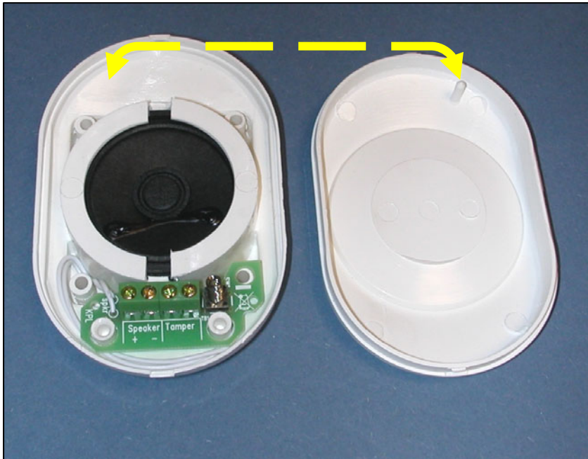
Fig. 1. I30 Teletone Tampered Sounder 16 Ohm

To ensure correct seating, (when assembling Teletone Casework), that the case cover pin is on the topmost inside face, (shown by the arrow).